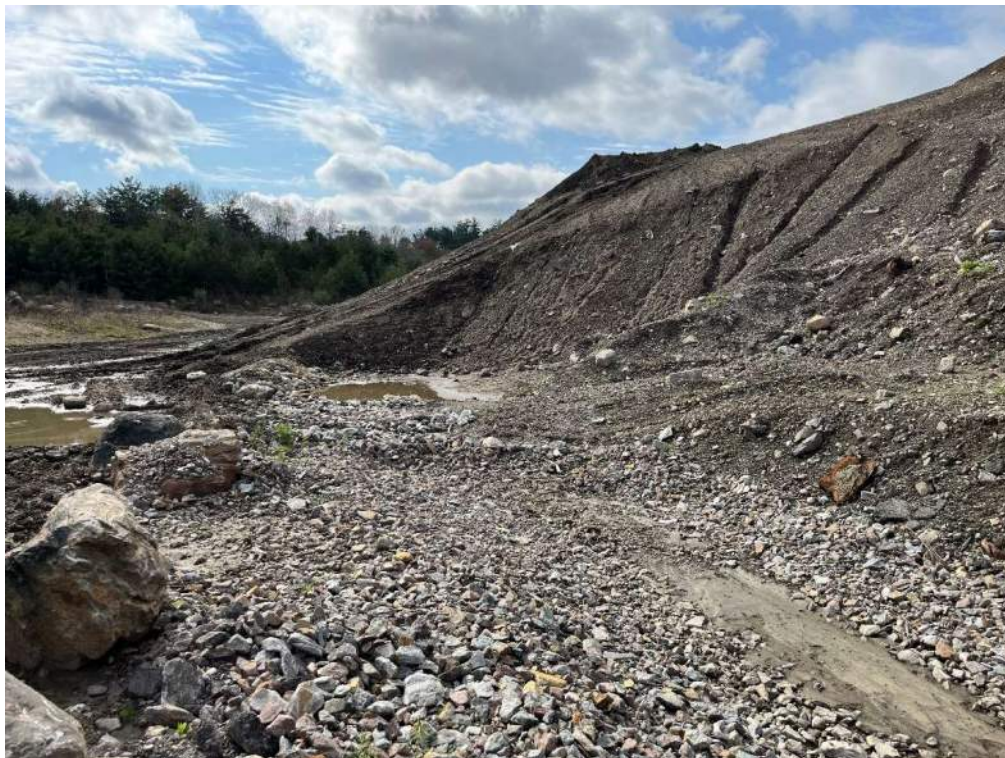
Photo 8 – Swale between temporary stormwater basin and temporary rip rap settling area.