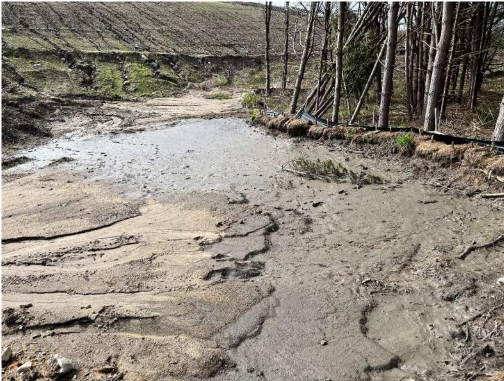
Photo 4 – Southwestern slope with sediment accumulating against the erosion control.