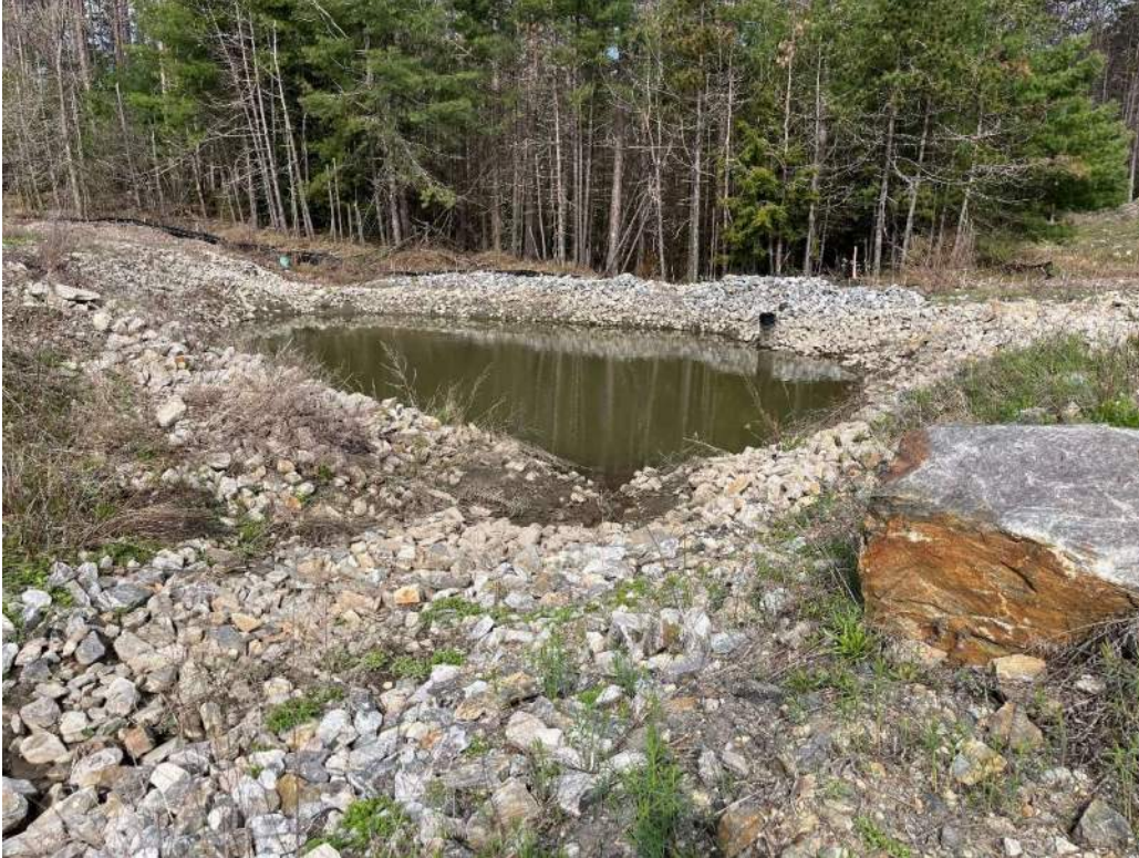
Photo 9 - Temporary rip rap settling area.