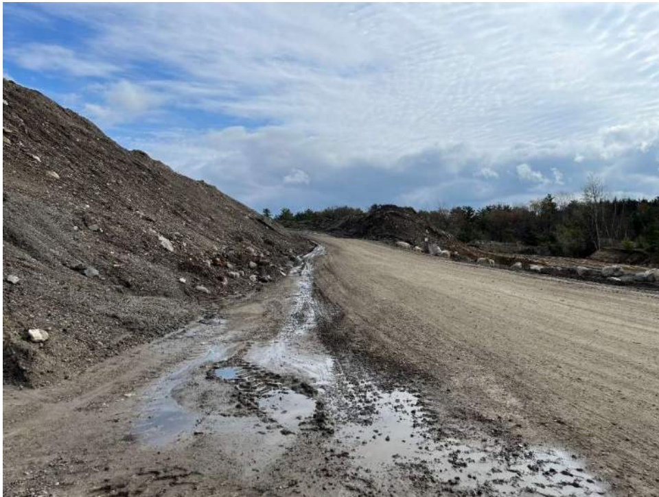
Photo 12 –Material placed and graded at the center of the Site with grading for truck access