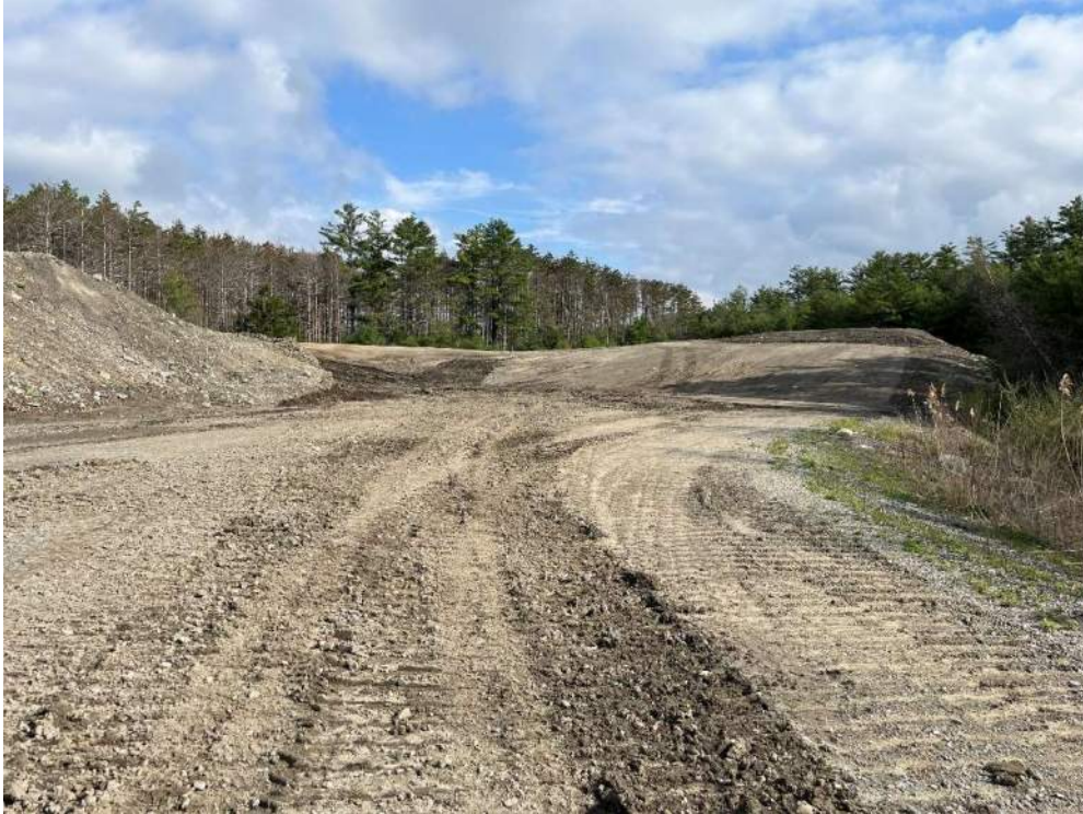
Photo 10 – Material placed and graded at the northern limits of the site.