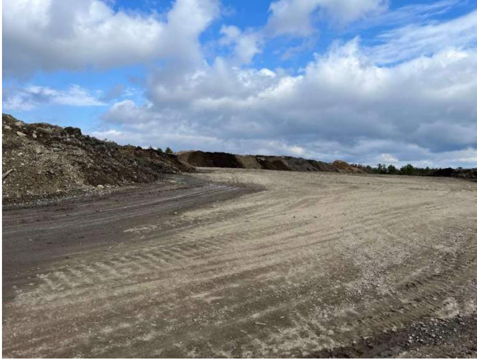
Photo 13 –Material placed and graded at the center of the Site with grading for truck access

\\\\tighebond.com\data\Data\Projects\W\W1157 Winchendon\081 - Mabardy LF Inspections\Report_Evaluation\2023\04-2023\04-2023 Report.docx