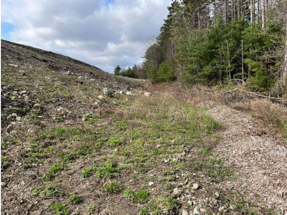
Photo 11 –Erosion control with sediment buildup on the western limits of the Site.