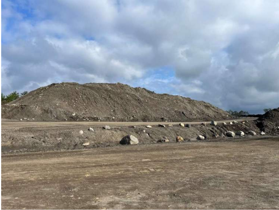
Photo 3 –Material placed and graded at the center of the Site with grading for truck access