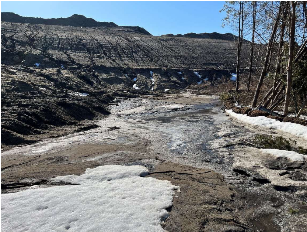
Photo 6 – Southwestern slope with sediment accumulating against the erosion control.