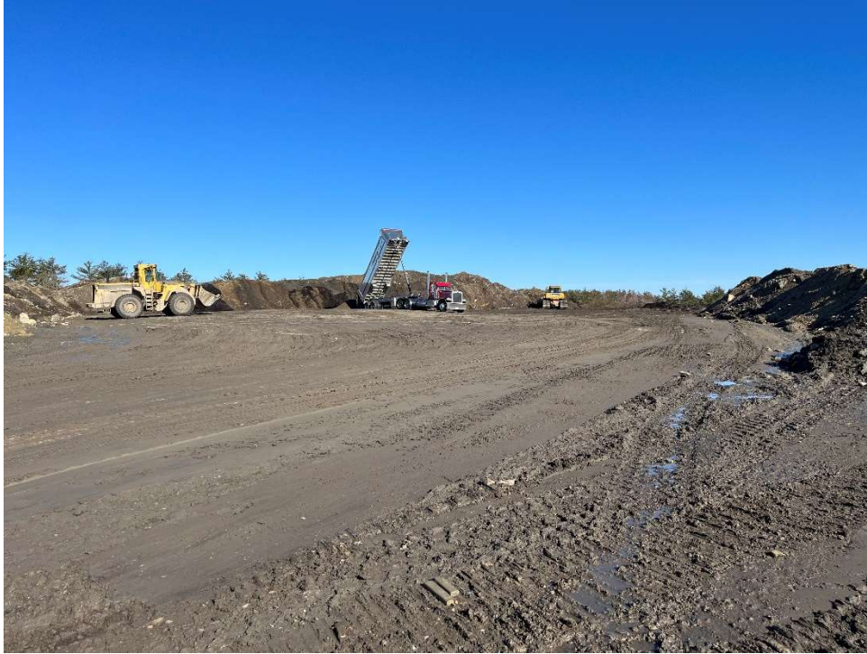
Photo 15 –Material placed and graded at the center of the Site with grading for truck access

\\\\tighebond.com\\data\\Data\\Projects\\W\\W1157 Winchendon\\081 - Mabardy LF Inspections\\Report_Evaluation\\2023\\02-2023\\02-2023 Report.docx