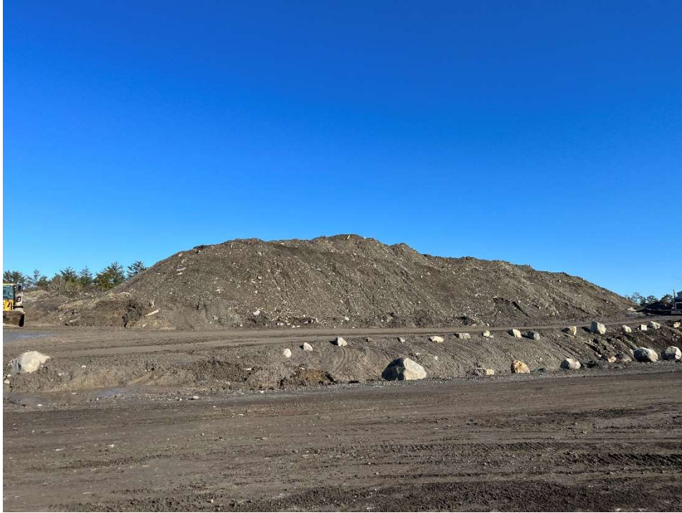
Photo 3 –Material placed and graded at the center of the Site with grading for truck access