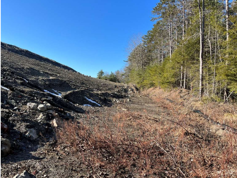
Photo 13 –Erosion control with sediment buildup on the western limits of the Site.