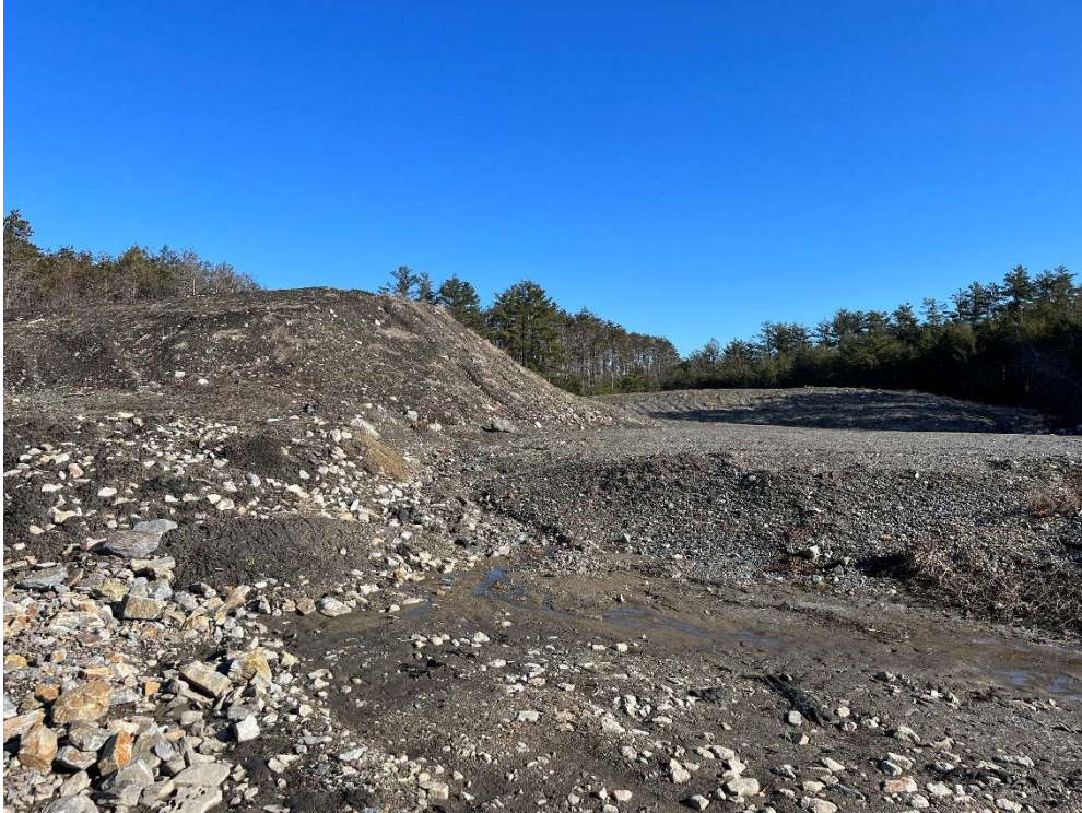
Photo 12 – Material placed and graded at the northern limits of the site.