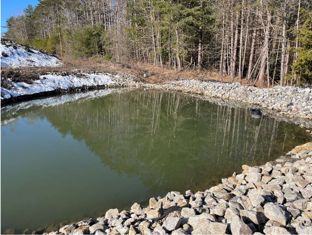
Photo 11 - Temporary rip rap settling area.