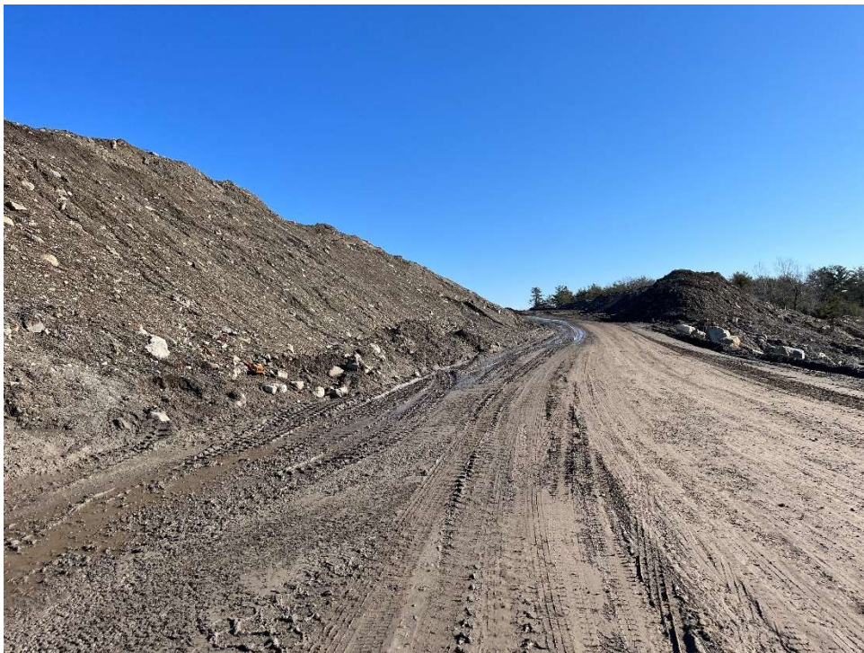
Photo 14 –Material placed and graded at the center of the Site with grading for truck access