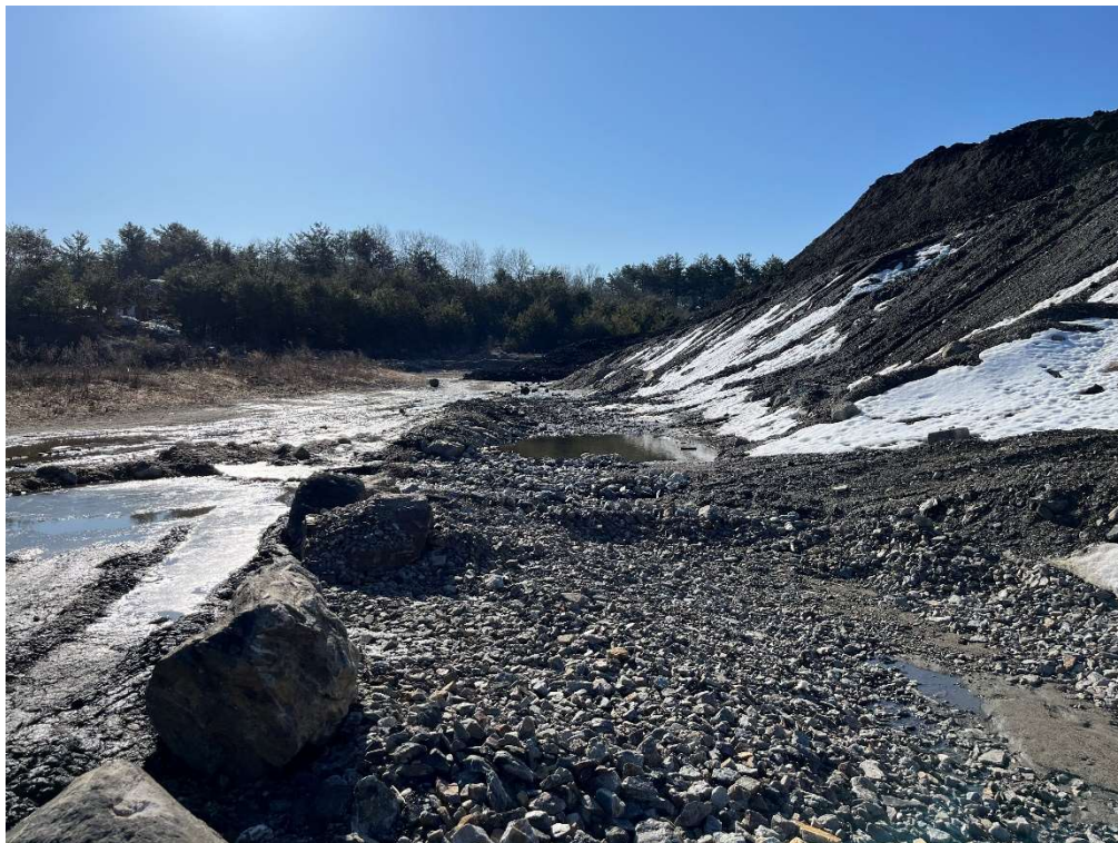
Photo 10 – Swale between temporary stormwater basin and temporary rip rap settling area.