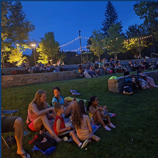
Movie Nights 2025