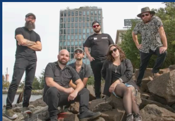
Slainte & More