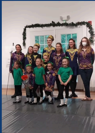
Flying Irish Dance Troupe