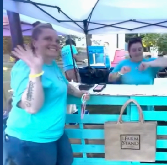
Sunset Socials 2025