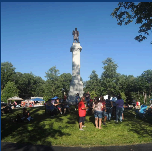
Food Truck Festival 2025