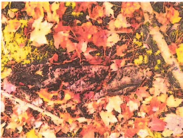
Soil at Plot A7-W