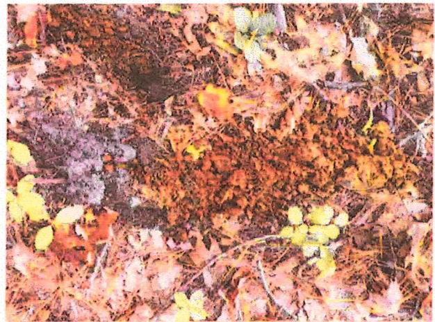
Soil at Plot A7-U