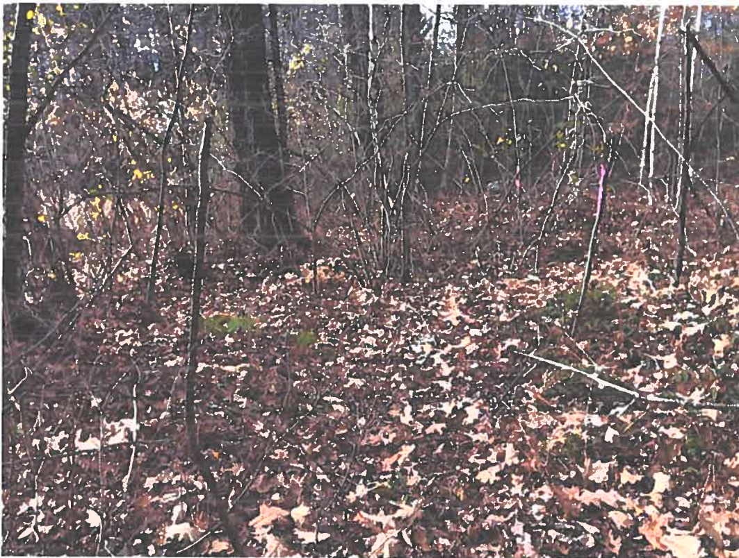
Boundary of offsite wetland (above) bordering on drainage swale (below).

Prior to heading out to the site to delineate any potential wetland along the frontage I reviewed the MassGIS data layers and NRCS soil mapping for the above-referenced property. The MassGIS data did not show any wetland resource areas on the property and the NRCS soil map indicated that the entire site consisted of a nonhydric Colton gravelly, loamy sand. When I arrived at the site I noted a drainage swale that ran along the side of the road that drained a small wetland area. The swale drains to a catch basin on Baldwinville State Road and apparently discharges stormwater to the culvert beneath the highway.