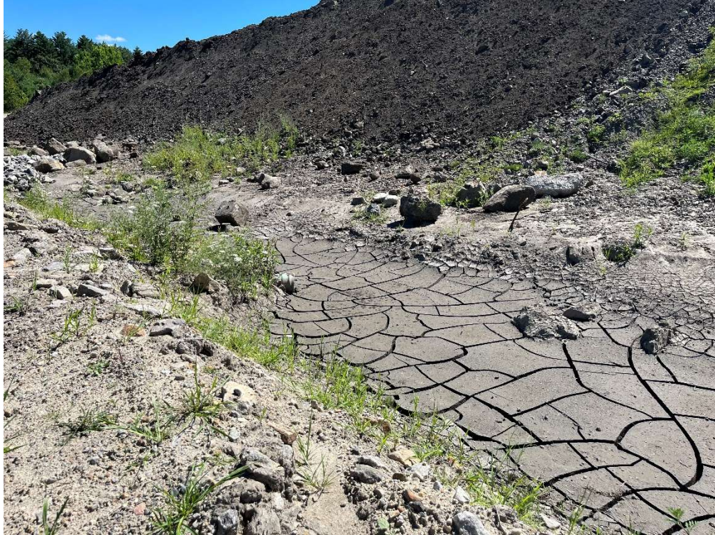
Photo 5 – Swale between temporary stormwater basin and temporary rip rap settling area.