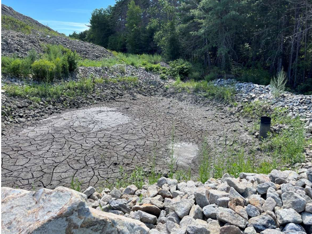
Photo 7 - Temporary rip rap settling area.