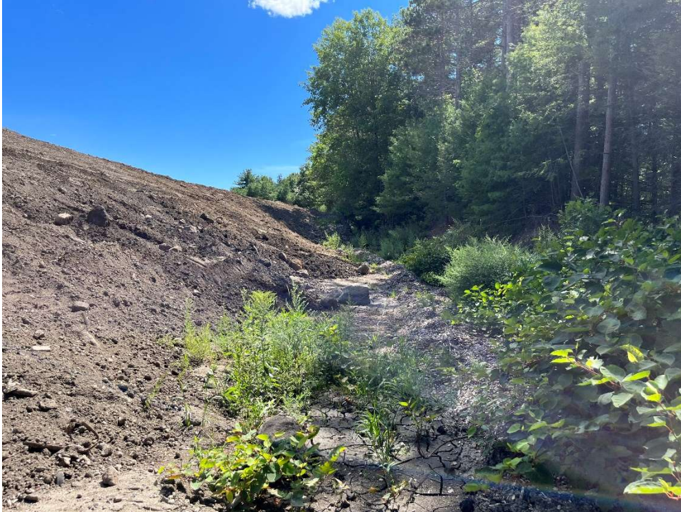
Photo 9 – Representative view of erosion control on the western limits of the Site.