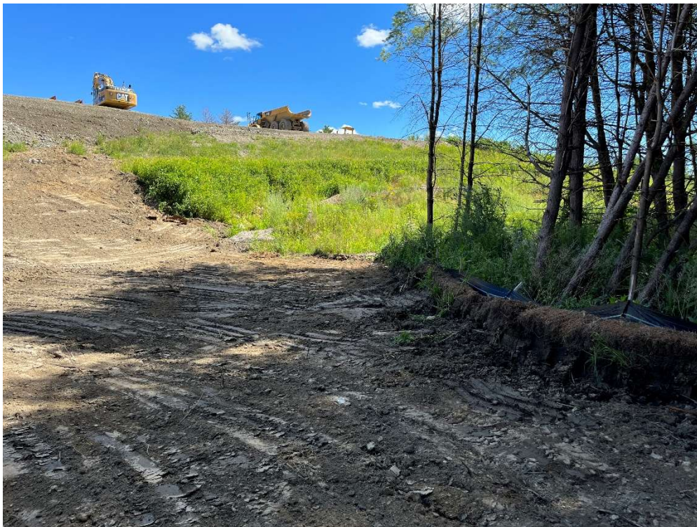
Photo 10 –Erosion control cleared of sediment at southwestern limits of the Site.