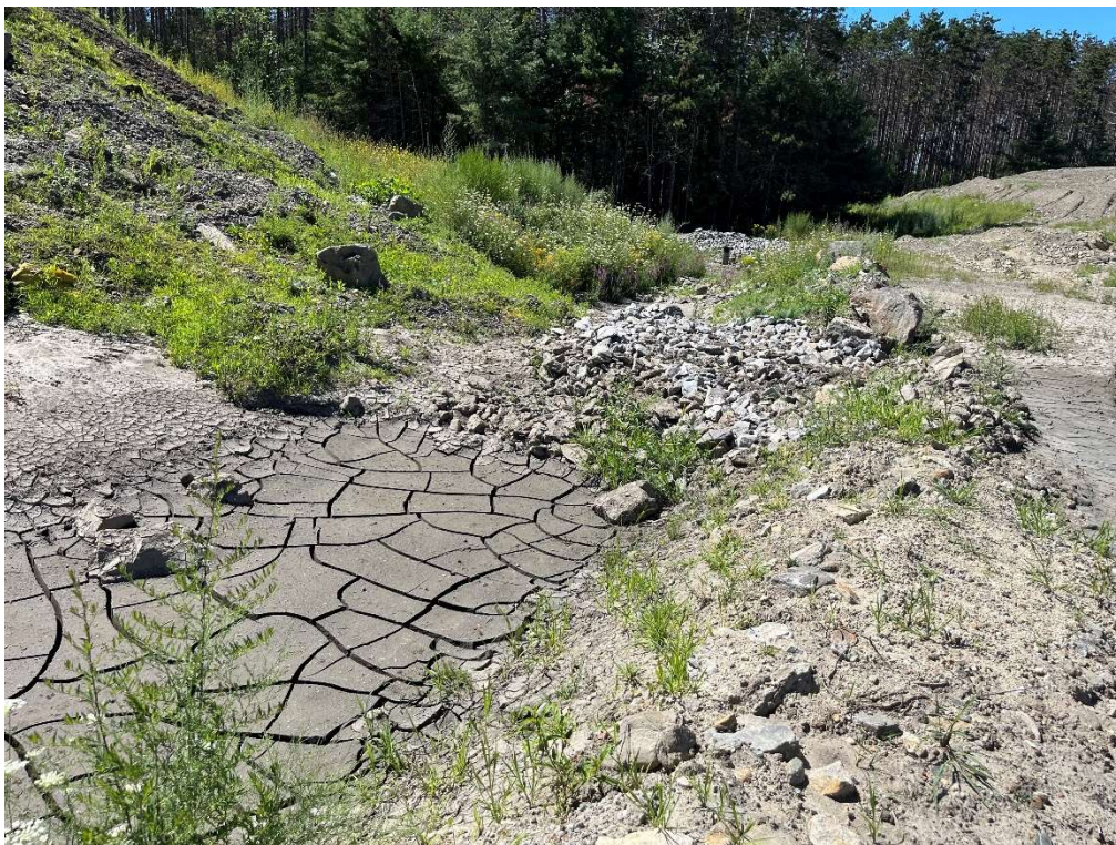
Photo 6 – Swale between temporary stormwater basin and temporary rip rap settling area.