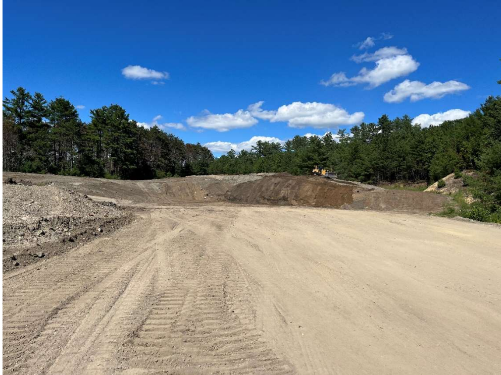
Photo 8 - Material placed and graded at the northern limits of the site.