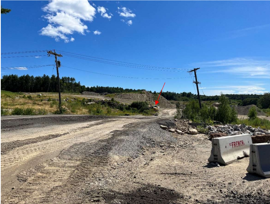
Photo 13 – Water truck collecting water from adjacent site for dust control.

\\tighebond.com\data\Data\Projects\W\W1157 Inspections\Report_Evaluation\2022\08-22\08-2022 Report (AutoRecovered).docx