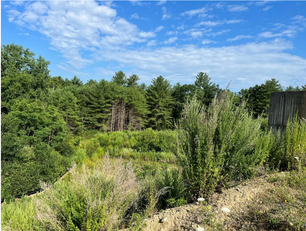
Photo 13 – Existing slope and erosion control at the southern limits of the Site.