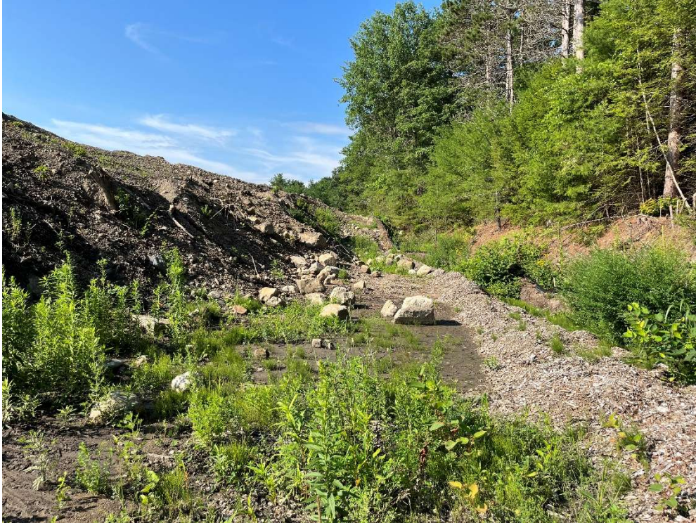
Photo 9 – Representative view of erosion control on the western limits of the Site.