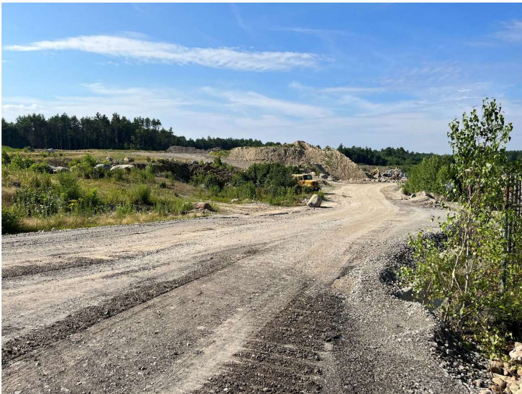
Photo 14 – Water truck collecting water from adjacent site for dust control.