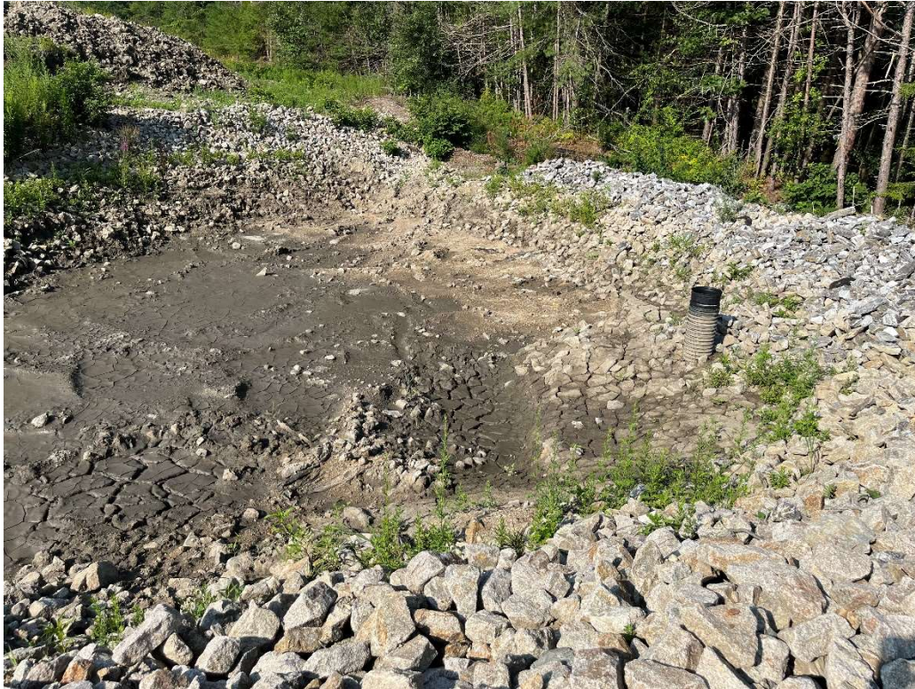
Photo 7 - Temporary rip rap settling area.