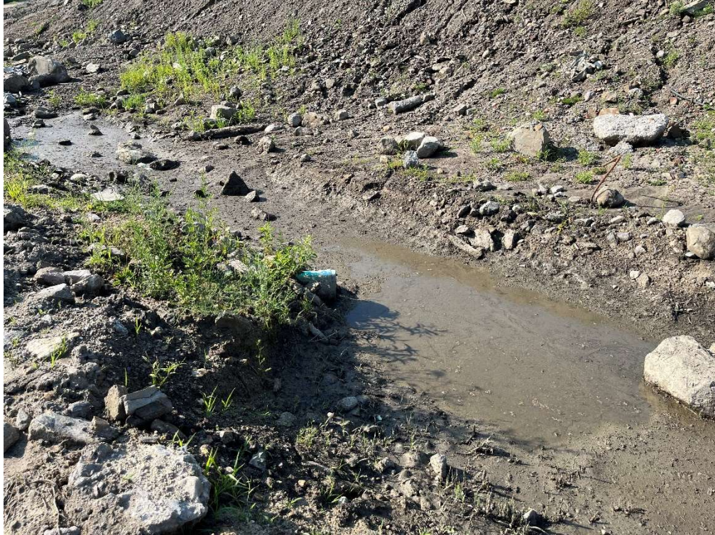
Photo 5 – Swale between temporary stormwater basin and temporary rip rap settling area.