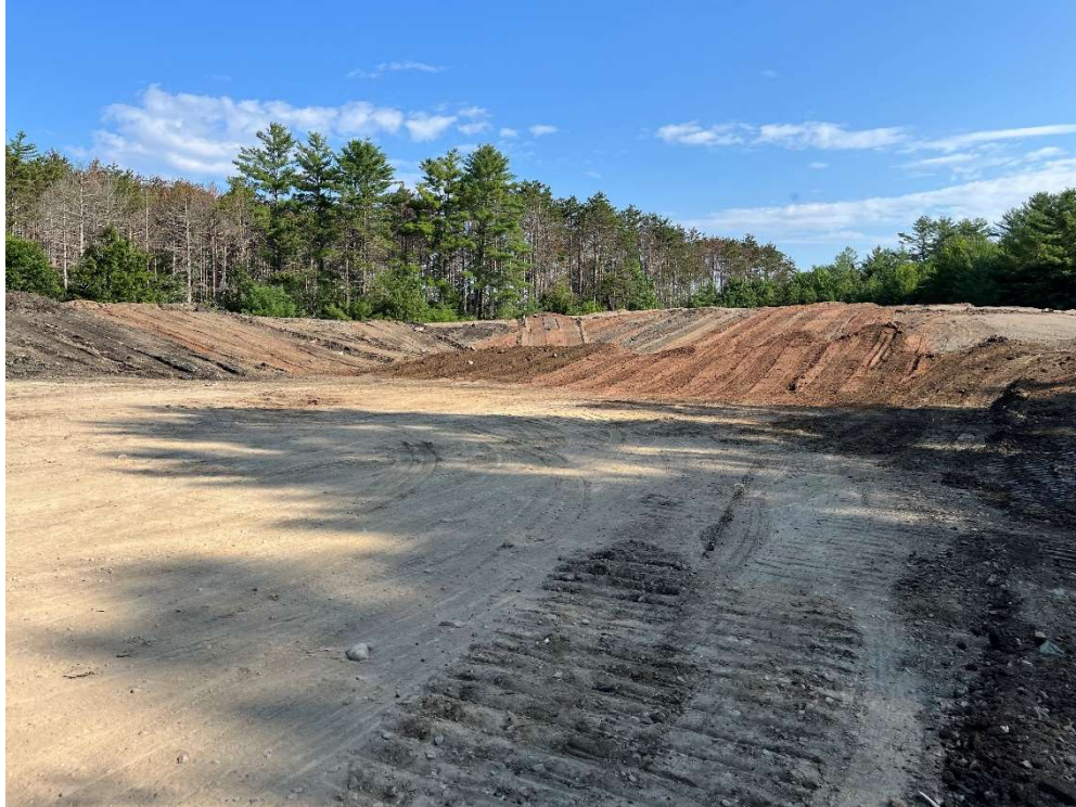
Photo 8 - Material placed and graded at the northern limits of the site.