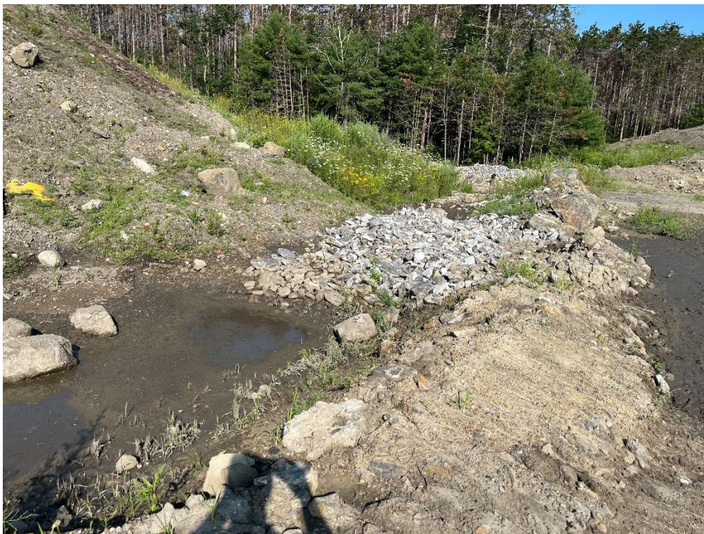
Photo 6 – Swale between temporary stormwater basin and temporary rip rap settling area.