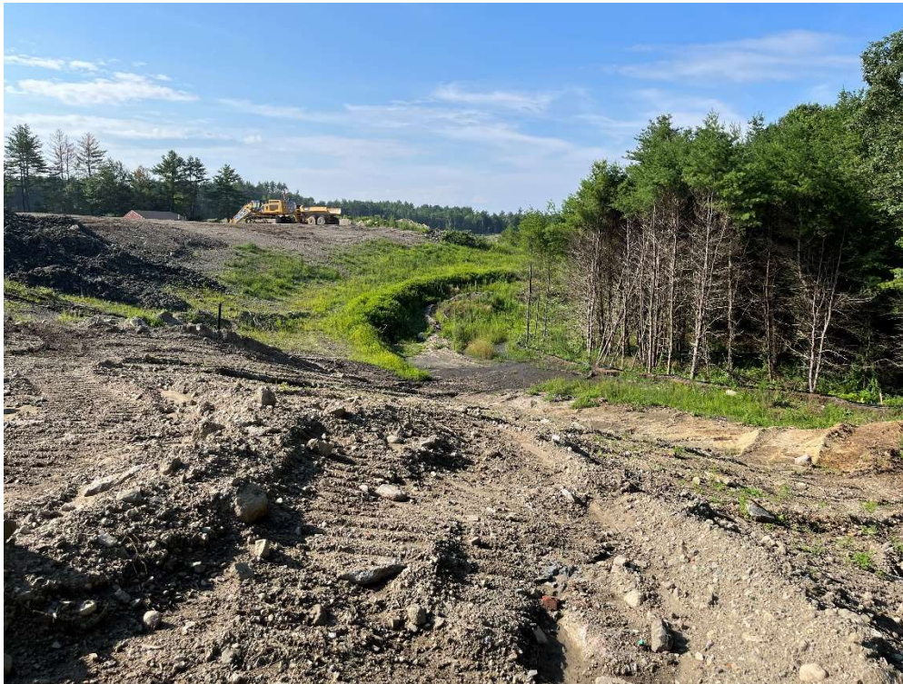
Photo 10 – Slope and erosion control at southwestern limits of the Site.