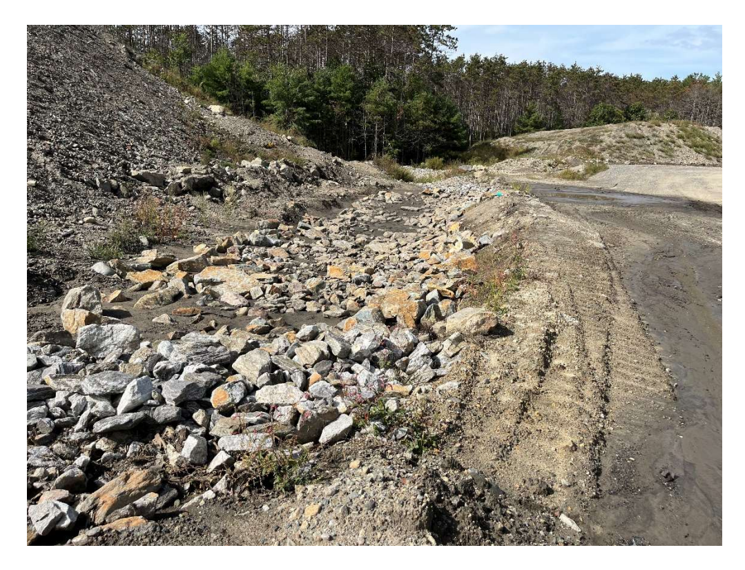
Photo 5 – Swale between temporary stormwater basin and temporary rip rap settling area.