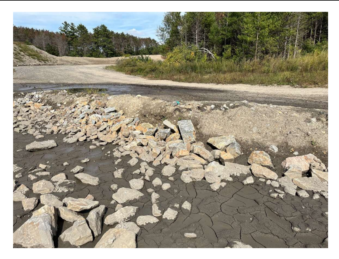
Photo 7 – Location of broken drainage pipe under additional riprap.