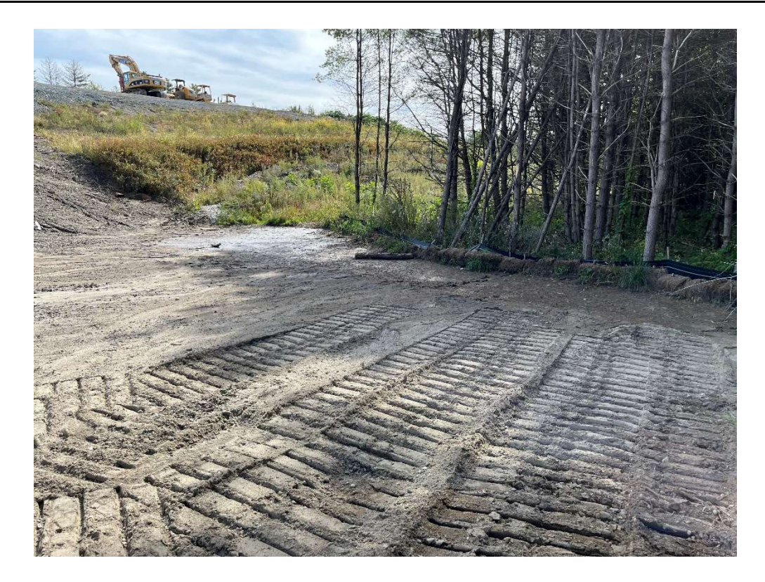
Photo 11 -Erosion control cleared of sediment at southwestern limits of the Site.