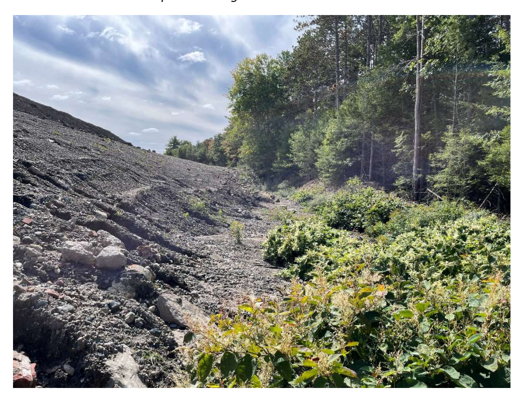
Photo 10 - Representative view of erosion control on the western limits of the Site.