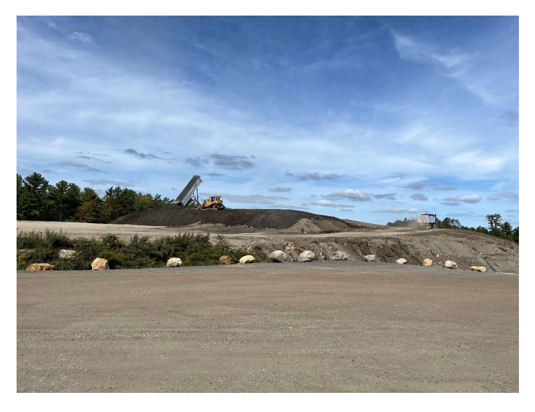
Photo 12 -Material being placed and graded at the center of the Site.