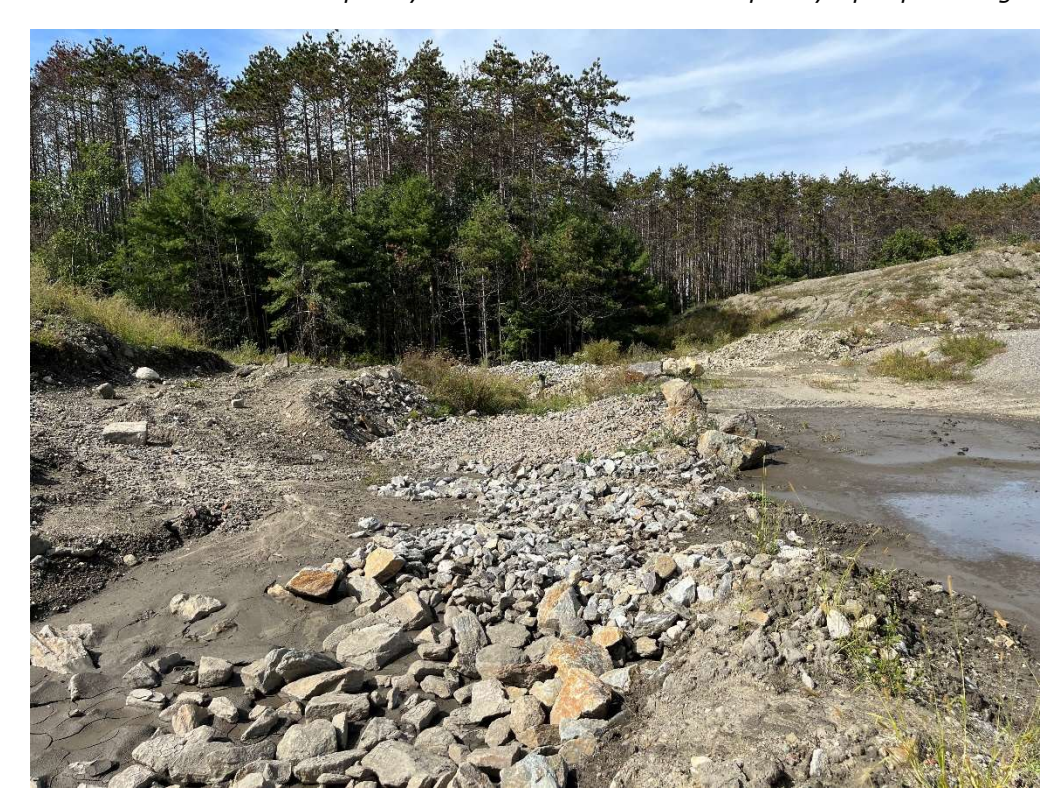
Photo 6 – Swale between temporary stormwater basin and temporary rip rap settling area.