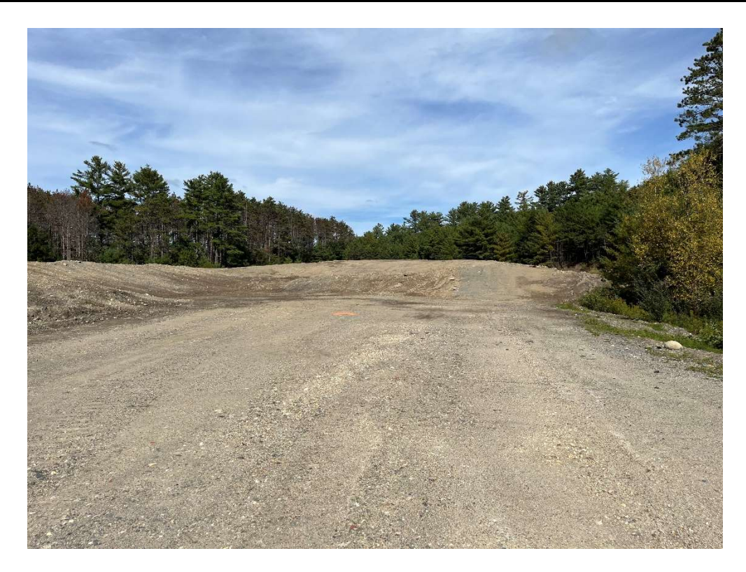
Photo 9 – Material placed and graded at the northern limits of the site.