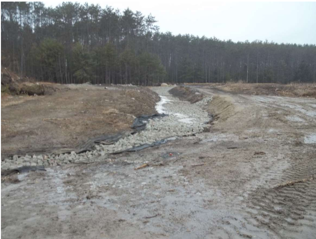
Photo 4 - Swale between temporary stormwater basin and temporary rip rap settling area