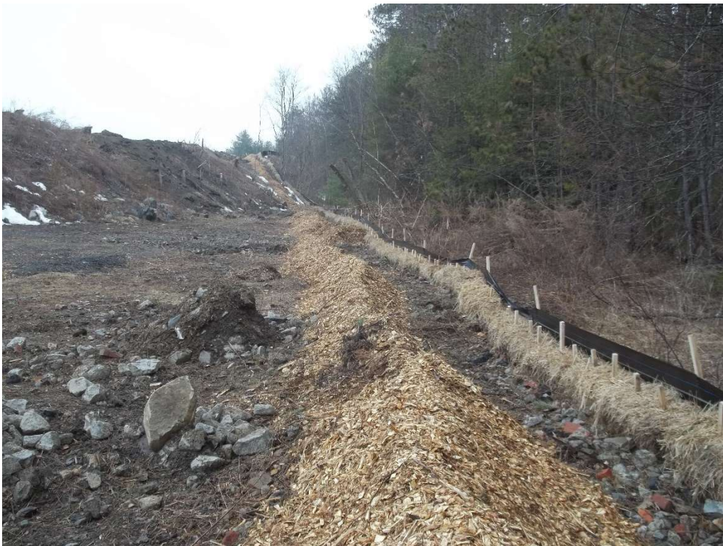
Photo 6 - Representative view of erosion control on the western limits of the Site