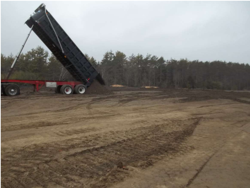
Photo 1 - Material delivered to site and placed for grading and shaping.