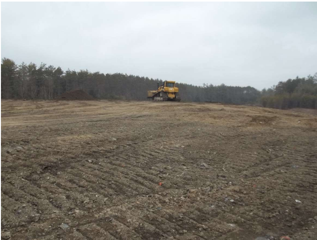
Photo 2 - Bulldozer spreading subgrade material in the area of Section B-B.