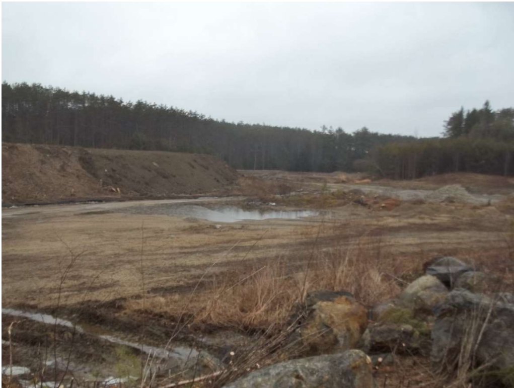
Photo 3 - Temporary stormwater basin. 4' high berm with rip rap overflow not yet constructed.