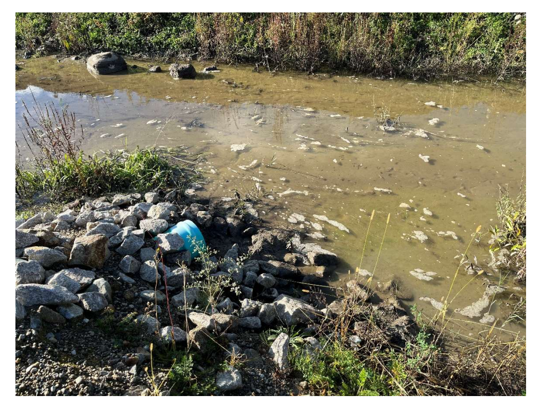
Photo 4 – Stormwater culvert under access road, sediment and standing water in swale.