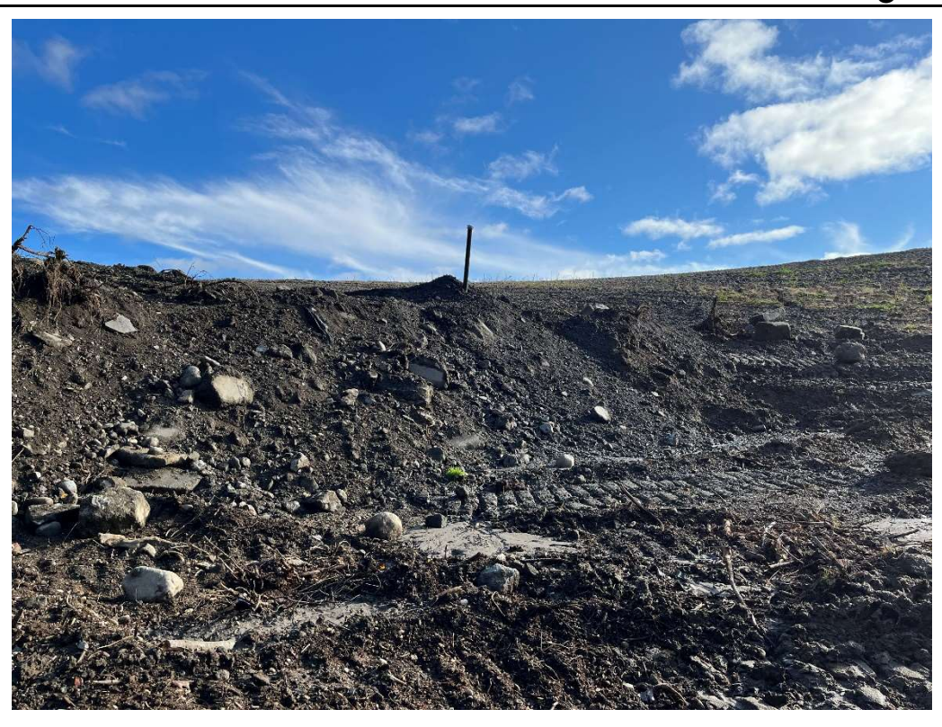
Photo 9 – Repairs and continued erosion in the subgrade slope adjacent to a monitoring well.