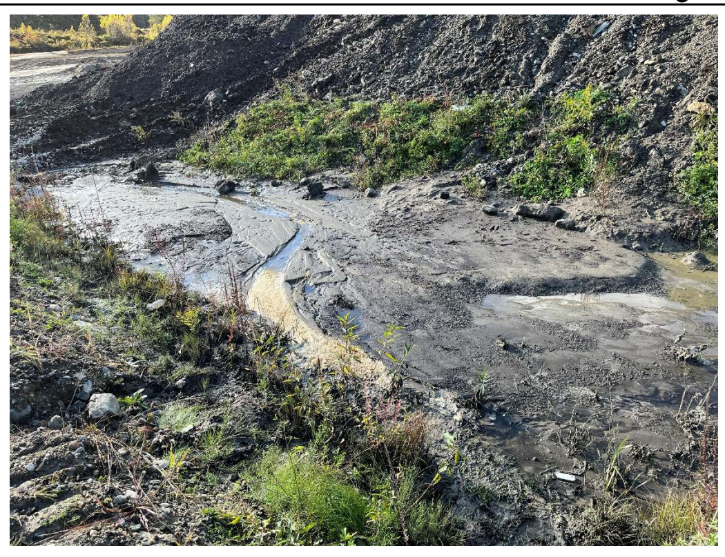
Photo 5 – Sediment built up in swale between temporary stormwater basin and temporary rip rap settling area.