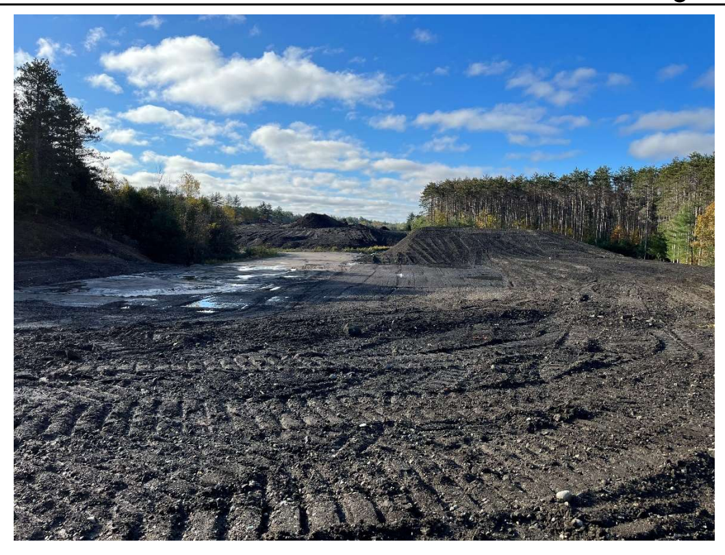
Photo 7 – Material placed and graded in the northern area of the site.