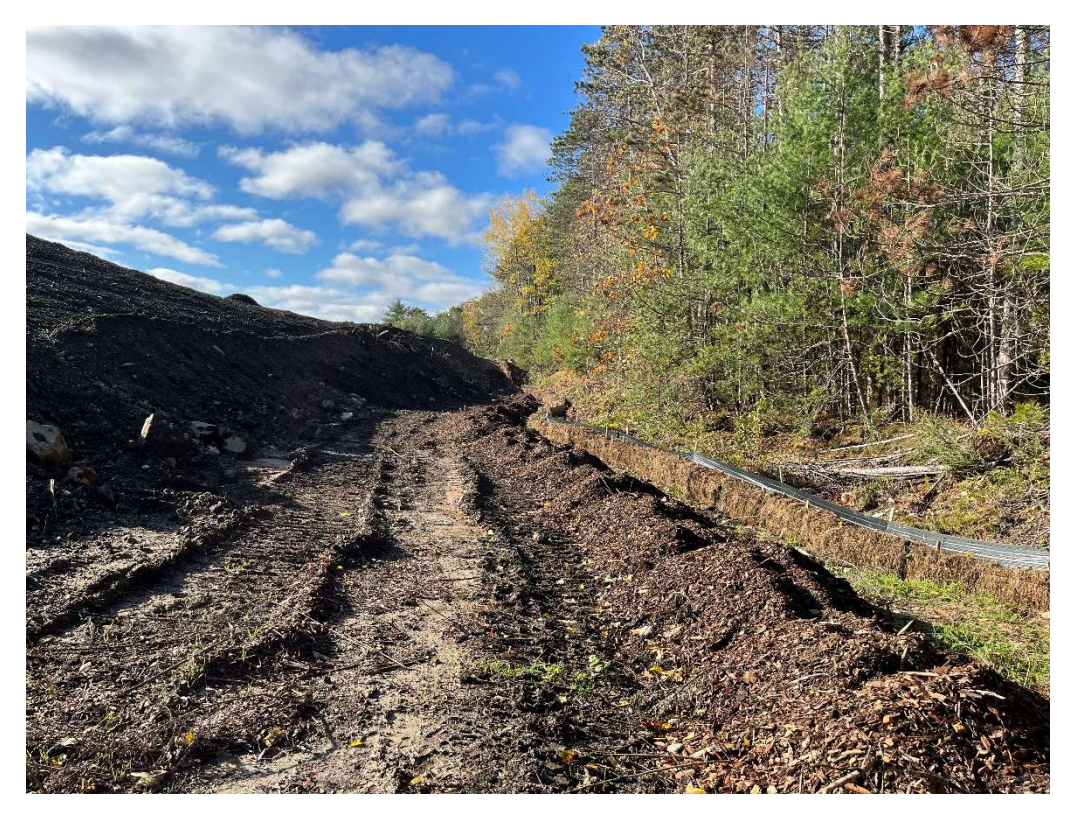
Photo 8 – Representative view of erosion control on the western limits of the Site.