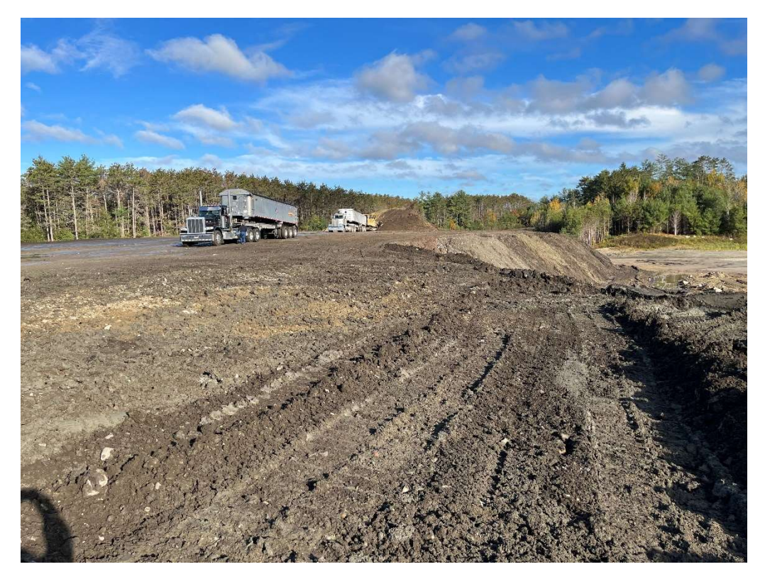
Photo 2 – Material delivered to the Site and placed for grading and shaping.