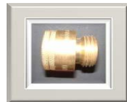
Vacuum Breaker for hose bib.

For more information, please review the Cross-connection Control Manual from the U.S. EPA's website at http://water.epa.gov/infrastructure/drinkingwater/pws/crossconnectioncontrol/index.cfm . You can also call the Safe Drinking Water Hotline at (800) 426-4791.